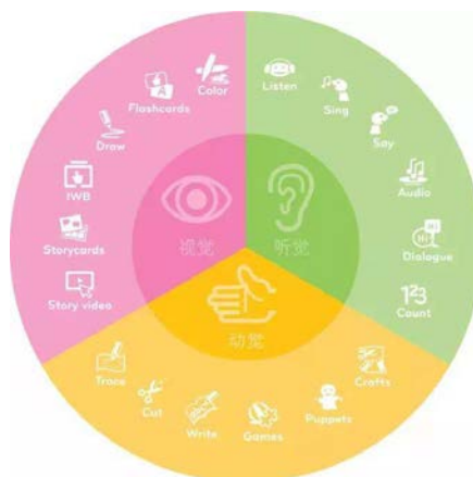
Figure 1 Visual, auditory and kinesthetic of linked students