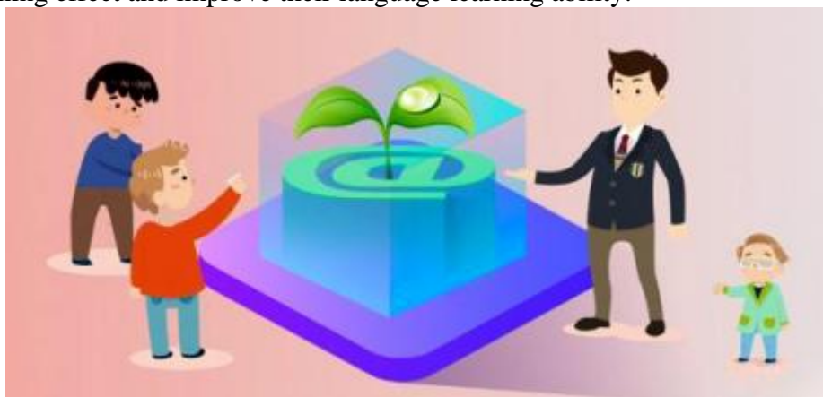
Figure 2 Student groups in the web environment

The network environment mainly takes the network as the foundation, constructs the network teaching and learning environment, the teacher and the student takes the computer and the network as the tool, with the help of the network platform related learning software and the teaching resources, develops the language teaching and the language learning, but the network environment student group mainly through the study knowledge, the creation knowledge, the preservation knowledge and the sharing knowledge, as shown in the figure 2. This way of language learning is based on the theory of educational philosophy, educational psychology, educational communication and management psychology, and takes the language ability, comprehensive application ability and learning effect as the goal of strengthening learning, so that teachers' teaching method and students' language learning mode can be further innovated, so as to create a good language learning environment and learning conditions actively, and provide for promoting students' subjective initiative. Under the background of network, language learning mode, students can not only realize the transformation of traditional learning methods of one-way communication, but also show the characteristics of cooperative, autonomous, open and creative learning, strengthen the students' language learning effect and improve their language learning ability.